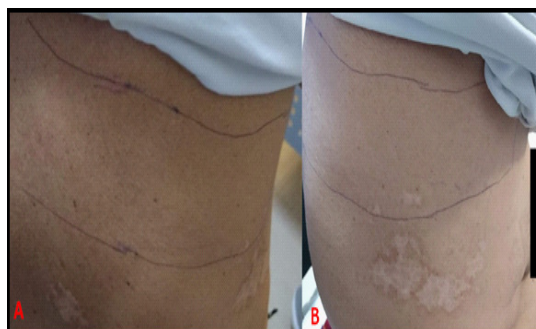
Figure 2: Delimitation of the affected area by neuropathic alterations after lytic ESPB. A. Posterior Chest view. B Lateral chest view.

also reported better sleeping and quality of life in terms of doing daily activities such as walking, dress, and doing house work without interruption because of pain. In the 6 months and 1 year follow-ups the patient continues with pain relief and improvement in quality of life, no new pains nor adverse effects were reported.